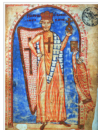
Frederick Barbarossa in a 13th century chronicle

Frederick in the meantime was focused on restoring peace in the Rhineland, where he organized a magnificent celebration of the canonization of Charles the Great (Charlemagne) at Aachen, done under the authority of the antipope Paschal III. Concerned over rumours that Alexander III was about to enter into an alliance with the