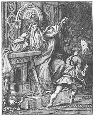
Frederick sends out the boy to see whether the ravens still fly.

Otto's other major work, The Two Cities was an exposition of the work of St. Augustine of Hippo of a similar title. The latter work was full of Augustinian negativity concerning the nature of the world and history. His work on Frederick is of opposite tone, being an optimistic portrayal of the glorious potentials of imperial authority. (See description supra.) [83]