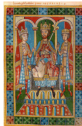
Frederick Barbarossa, middle, flanked by his two children, King Henry VI (left) and Duke Frederick VI (right). From the Welf Chronicle