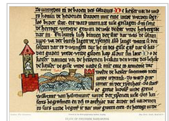
Barbarossa drowns in the Saleph. From the Gotha Manuscript of the Saxon Chronicle.

The Crusaders passed through Hungary, Serbia and Bulgaria and then entered Byzantine territory, arriving at Constantinople in the autumn of 1189. Matters were complicated by a secret alliance between the Emperor of Constantinople and Saladin, warning of which was supplied by a note from Sybilla, Ex Queen of Jerusalem. [2] (http://www.fordham.edu/halsall/source/1189barbarossa-lets.html) When they were in Hungary, Barbarossa personally asked the Hungarian Prince Géza, brother of the king Béla III of Hungary, to join the Crusade. The King agreed, and a Hungarian army of 2,000 men led by Géza escorted the German Emperor's forces. The armies coming from Western Europe pushed on through Anatolia (where they were victorious in taking Aksehir and defeating the Turks in the Battle of Iconium), and entered Cilician Armenia. The approach of the immense German army greatly concerned Saladin and the other Muslim leaders, who began to rally troops of their own to confront Barbarossa's forces. [3]